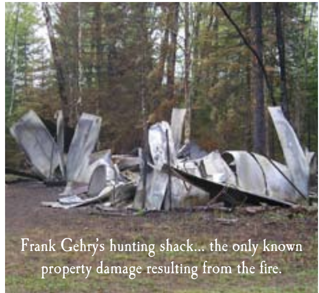
Frank Gehry's hunting shack... the only known property damage resulting from the fire.

We believe His Majesty is nine years old. Though other deer roam the property, we never see him during the summer. He apparently goes into the heart of the forest and returns when hunting season is over. We know he is very old for a deer. We have been honored to make his acquaintance.